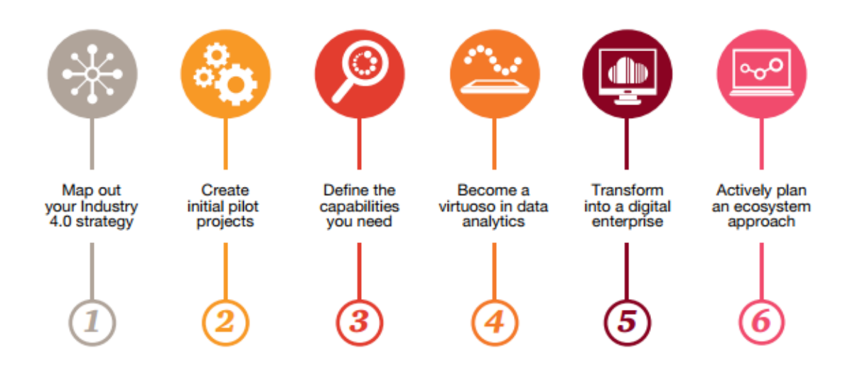
Fig. 2: Industry 4.0 application strategy step by step

Let us understand the Industry 4.0 application strategy step by step as below,