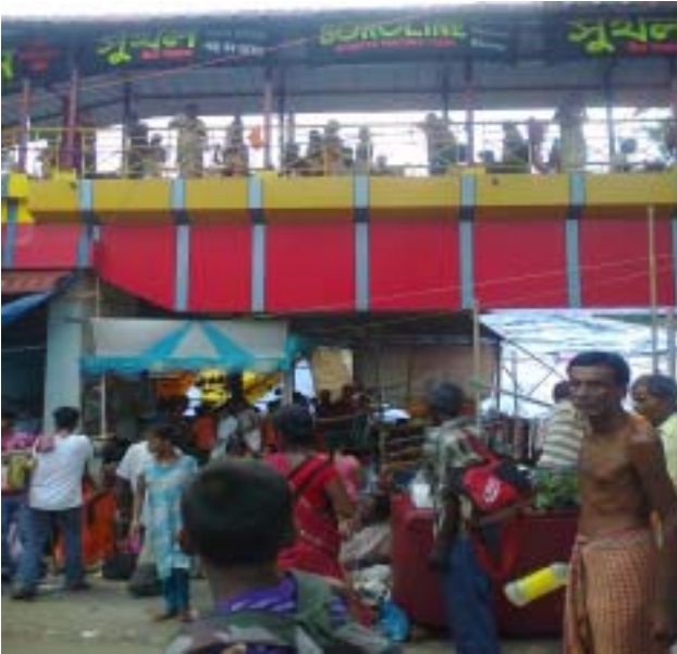
Fig 5: Foot bridge constructed near the Kamakhya temple

As a whole the main element of infrastructural development is the communication network and connectivity with the railway station, airport, bus stops etc which are well connected with the region.