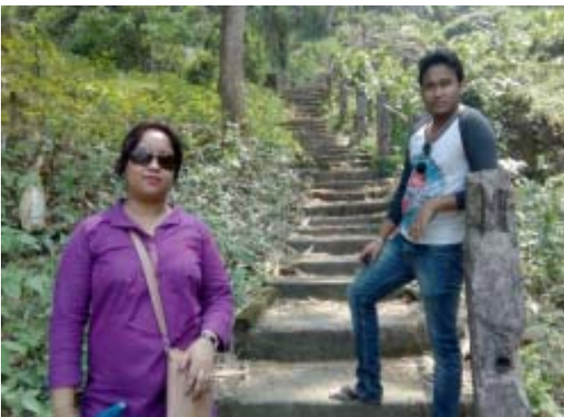
Fig 4: Staircases leading to Siddhi Ganesh temple (Near bank of Brahmaputra)