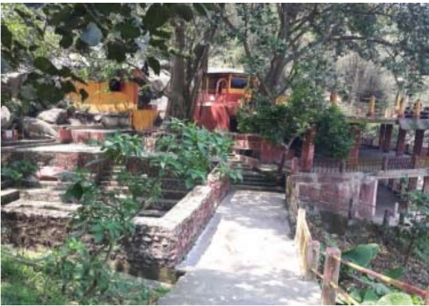
Fig 2: Staircases leading to Kotirlinga temple

the whole campus of the Kamakhya temple complex has been developed so that tourists can comfortably queue up. For security purpose CCTV cameras and metal detectors have been installed within the temple complex in addition to manual security system. The temples which are located in the hill slopes, like the Bhubaneswari temple , the Jai Durga temple, the Ban Durga temple, the Bagala Temple, the Kotirlinga temple, the Dwarpal Ganesh etc have been made accessible by constructing concrete staircases. Moreover, taking in view the safety measures , due to the locations of these temples in hill slopes, iron railings has been constructed along with the staircases. Drinking water facilities has been provided even to the remotest of the temples, like the Siddhi Ganesh temple.