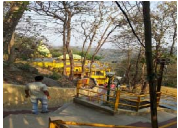
Fig 3 : Bagala temple