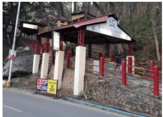
Fig 5: Staircases leading to Dwarpala Ganesh temple along with a resting shade for tourists