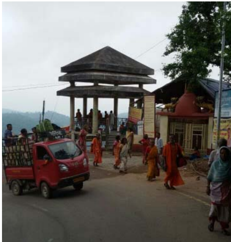
Fig 4 : Watch tower constructed by ATDC in the region

India Ltd. is under Progress, the water tank constructed at the western rim of the hill, nearing the Western Gate and the Mahakaal Ganesh temple. Apart from that, a branch of the State Bank of India is established near the Kamakhya temple and 6 (six) numbers of ATM has been established for easy money transactions for both the local people and the tourists that directly and indirectly supports tourism industry. In addition a health care centre has been run by the Kamakhya temple management authority which provides free health care and first-aid facilities to the tourists. However, during the Ambubachi mela temporary first aid and health care centres are also established to give proper service to the lakhs of devotees and tourists every year. Last but not the least, according to Hindu rituals, shoes are not allowed inside the temple and almost everyday hundreds of tourists visits the temple and there may always be a risk of losing shoes if one keeps it outside the temple compound. to avoid such an awkward situation, the management authority of the Kamakhya temple has provided for a booth where shoes and belongings of the tourists could be kept in safe custody with coupon facility.